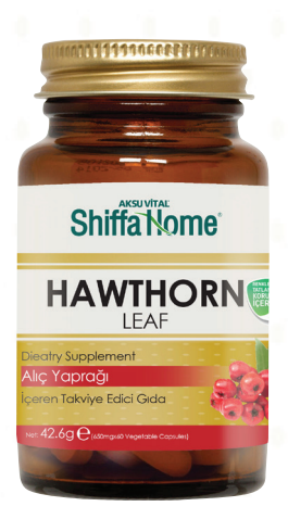
650mg x 60 Capsules

Suggested Usage: Twice a day 1 capsule with meals.