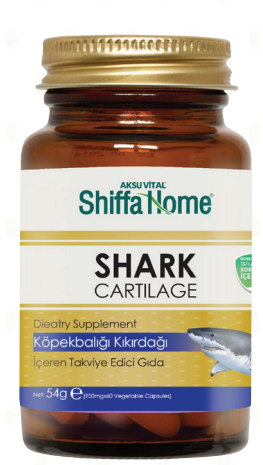
900mg x 60 Capsules

Suggested Usage: For adults, 2 capsules twice a day before meals.