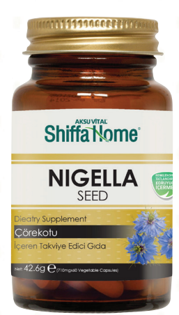
710mg x 60 Capsules