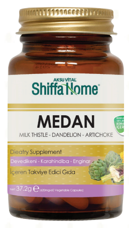
620mg x 60 Capsules