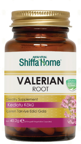
670mg x 60 Capsules

Warnings: Long distance drivers should not use. Do not use together with antidepressants or any other sleep regulating medicines. Pause for 15 days after 1 month usage.