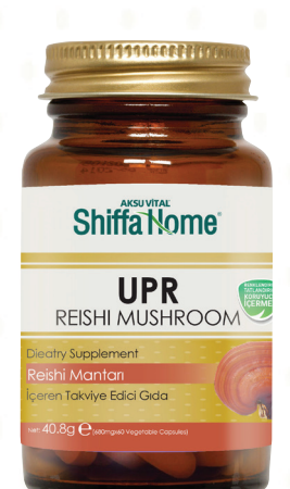
680mg x 60 Capsules

Suggested Usage: For adults 2 capsules twice a day before or after meals.