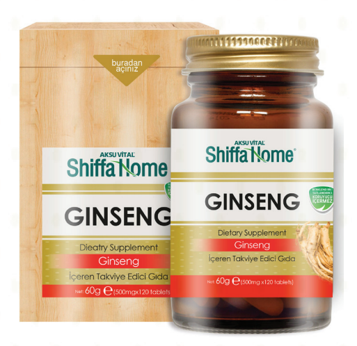
500ma x 120 tablets