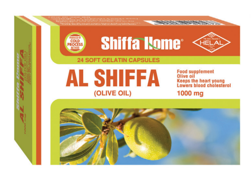
1000mg x 24 softgels