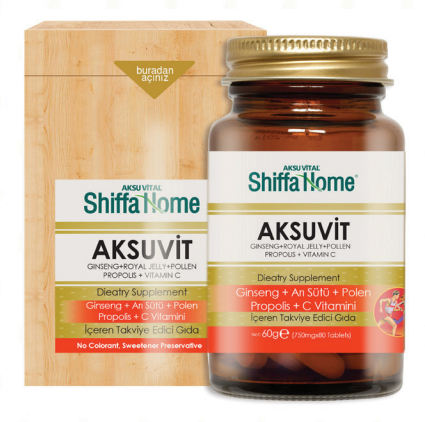
750mg x 80 Tablets