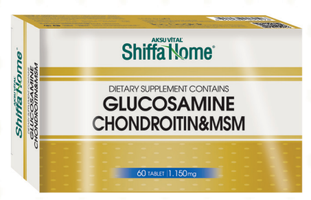
1150mg x 60 tablets