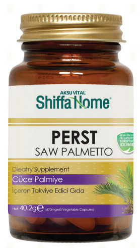
670mg x 60 Capsules

Suggested Usage: For adults, 2 capsules twice a day during meal.