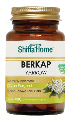
680mg x 60 Capsules