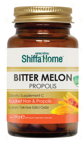
650mg x 60 Capsules